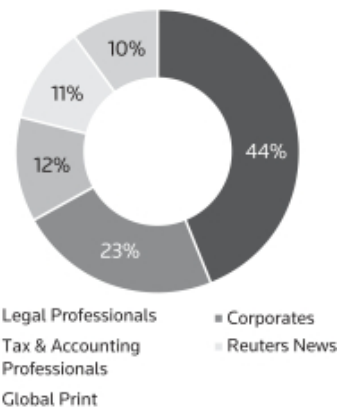
Second-Quarter 2020 Revenues

Provides legal and tax information primarily in print format to customers around the world.